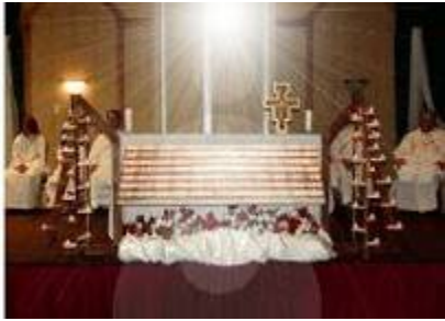
Necrology Of our deceased members - memorial votives