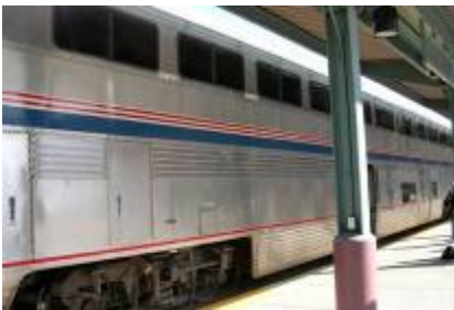
All aboard the Zephyr