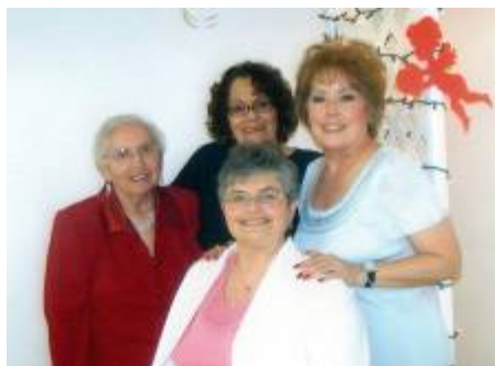
Auxiliary #4286 Officers 2008 (L to R)