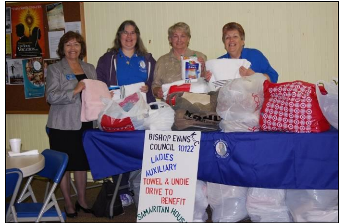
Towel & Underwear Drive