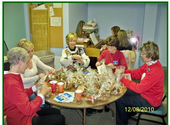
Christmas Cookie Project