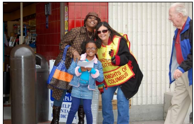
Helping with Tootsie Roll Drive