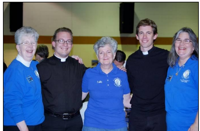
Spaghetti Dinner for Seminarian's